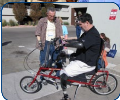
Left: An amputee tries cycling as part of activity day.